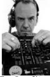
Fat Boy Slim aka Norman Cook