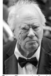
Sir Patrick Moore