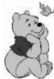
Winnie the Pooh