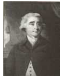
The Prince Regent George IV