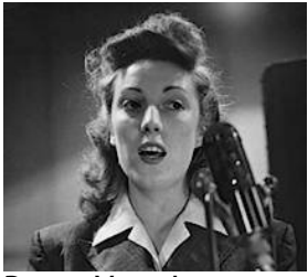
Dame Vera Lynn

The people pictured below all have strong connections with Sussex, but who are they?