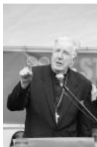
Cardinal, Cormac Murphy O'Connor