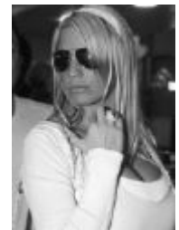
Katie Price aka Jordan